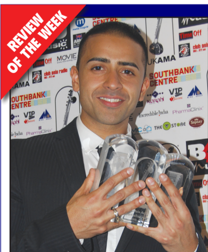
JOY: Jay Sean with his awards